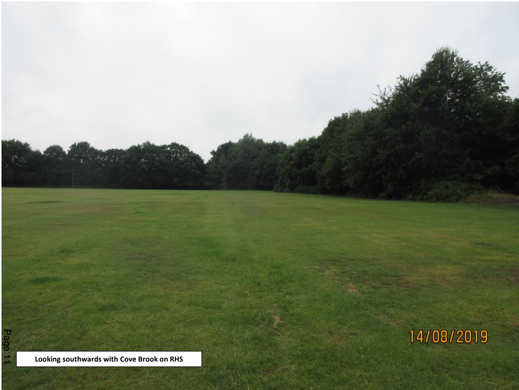
Looking southwards with Cove Brook on RHS